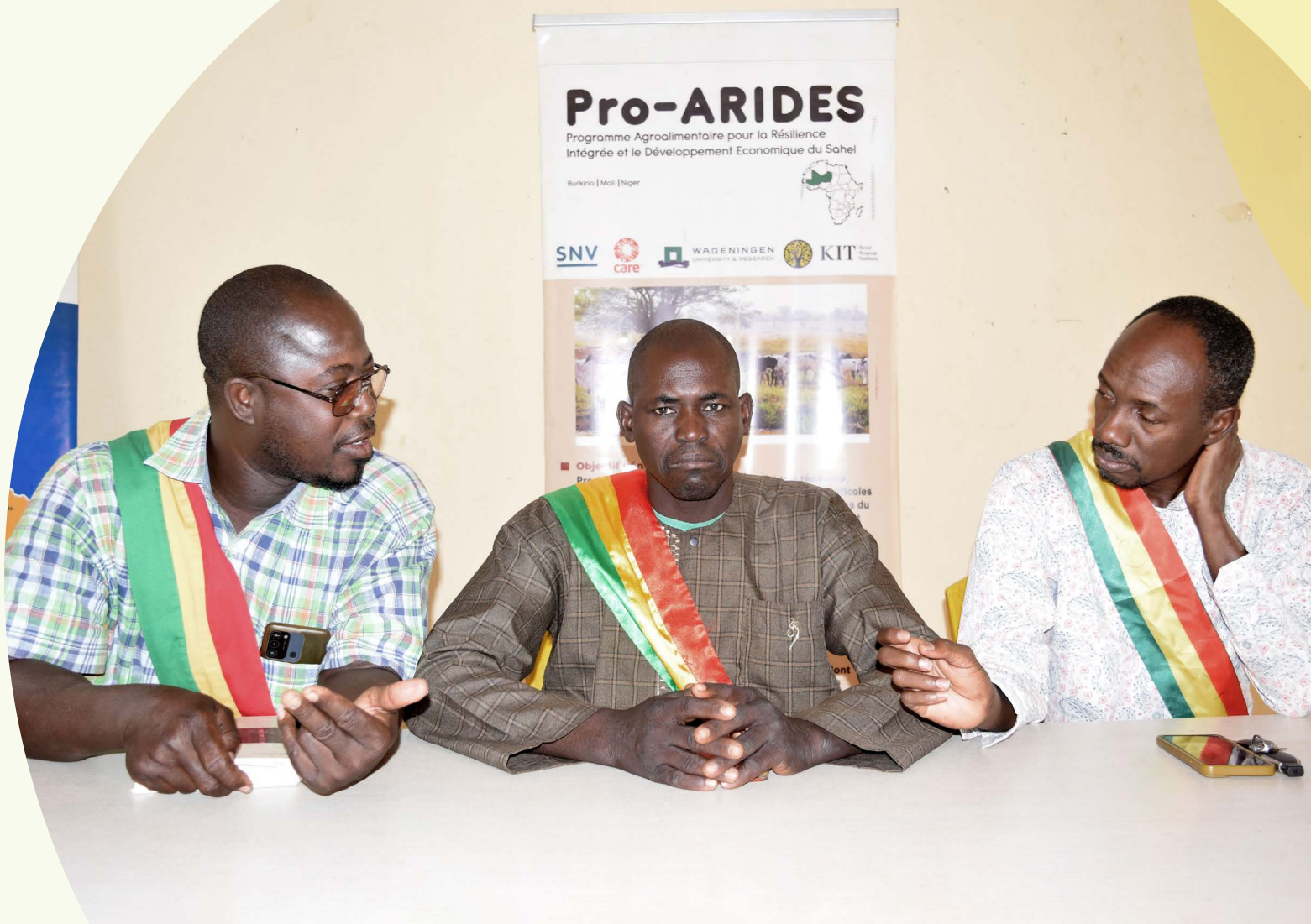
Mayors from the communes of Sanekuy (far right), Kaniegué (center) and Kava (far left), explaining the good governance supported by Pro-ARIDES