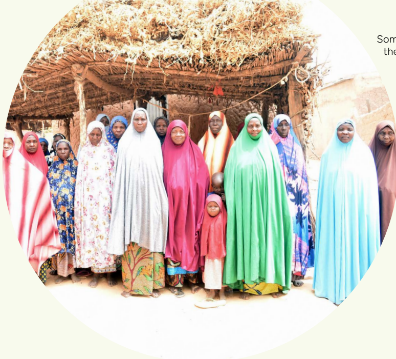
Some members of the Nazari AVEC